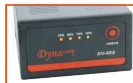
Power Indicator On DV Battery