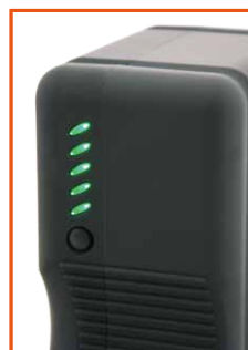
Power Indicator On Brick Battery

LED power status indicator shows accurately the remaining battery capacity.