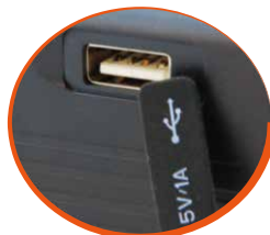
5V 1A USB Output Socket