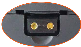
14.4V D-tap DC Output Socket

Most of Dynacore ENG batteries provide DC output socket, for powering other on-camera accessories simultaneously, such as the camera light.