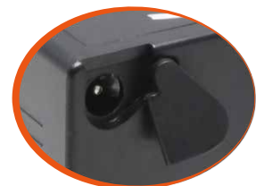
7.2V Pole DC Output Socket